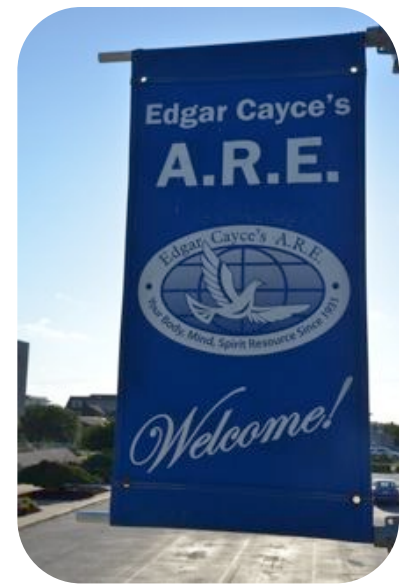
Welcome Sign in Virginia Beach

So, what are these principles? The readings state 'individuals must first seek that they be of service. Service rarely seeks individuals. God has given every man his abilities. Man seeks to apply same to God's service. This is God's work' (254-31)