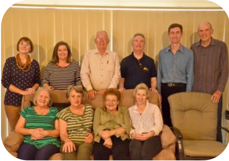
Some of the happy attendees enjoying the first day of 2015 at the Creswick New Year's Gathering